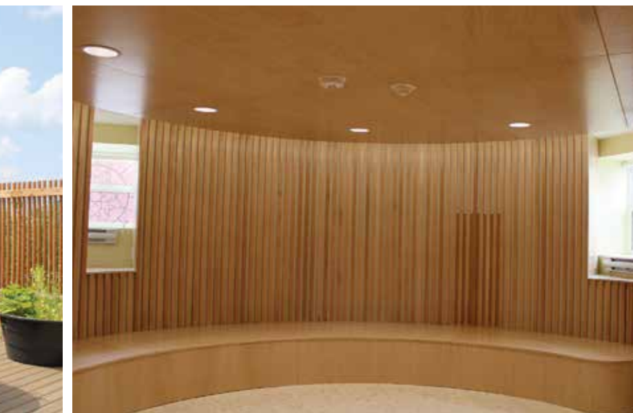
The Round Room, fully enveloped in cedar wood panels, is a space for smudging, ceremonies, sharing circles and other gatherings.

gender diverse people and their families. This project meets several of the recommendations from our report and will go a long way to ensuring people are safe and can start their healing journey in a supportive community.