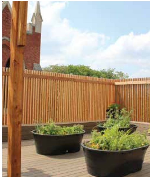
The Roof Top Garden is a place of healing that provides a safe space for families to spend time outdoors.

Tenants will be referred to housing in this building through WCWRC’s staff team, as well as through our referral partners, who are the North End Women’s Centre, Ikwe Widdjiitiwin, Willow Place, and